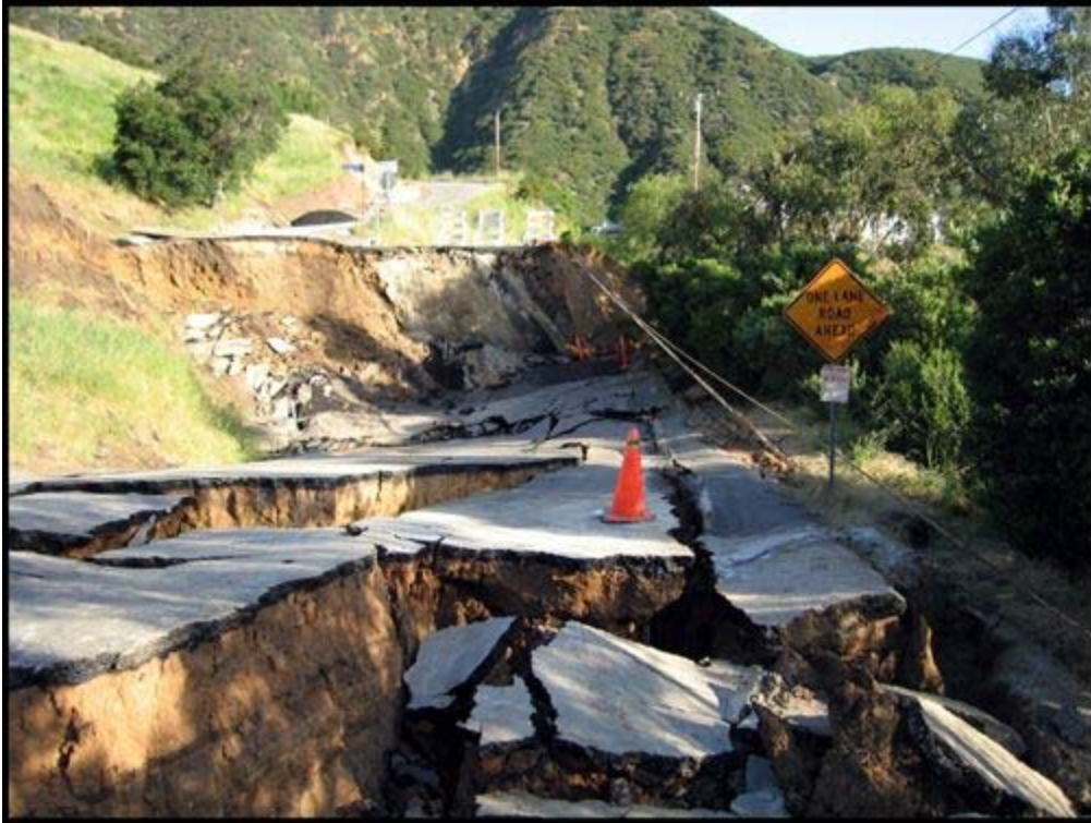
Hume Road Landslide, Malibu, CA